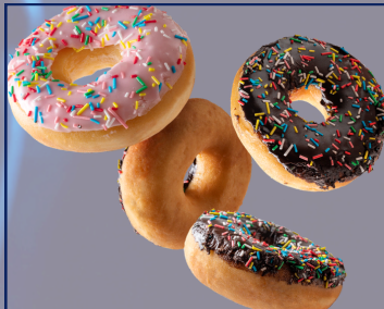
Donut Sale: 8 AM-All Day