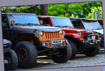
Jeep & Truck Rally: Noon

Supports the Montgomery County Hero Fund, a 501 (C) (3) corporation that provides immediate and ongoing relief and services to law enforcement officers, military personnel, firefighters, paramedics, and/or first responders or their loved ones who have lost their lives in the line of duty or having served the people of Montgomery County, PA.